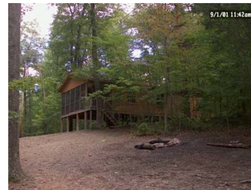
Vienna Host/Engleside Cabin