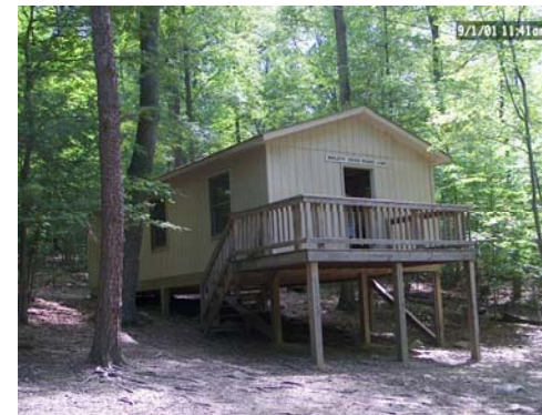
Baileys Cross Roads Cabin