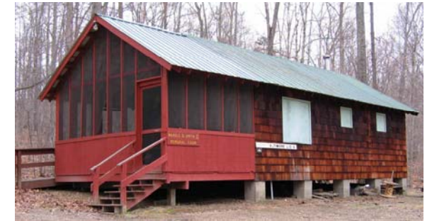
New Baltimore/Harold D. Smith II Cabin

A new formal corporation was formed with its present title and an I.R.S. 501.3c tax exemption was obtained allowing donations to the camp to be fully tax deductible.