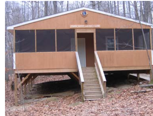
Park West Cabin