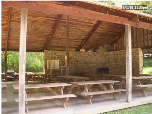
2000 Square Foot Pavilion with Fireplace

The Northern Virginia Lions Youth Camp, Inc., is a non-profit public service organization supported by the Lions Clubs of District 24A.