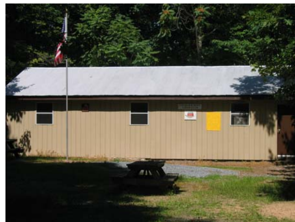
Herndon/Fauquier Host Cabin

Over the years youth groups, such as Boy Scouts, Cub Scouts, Girl Scouts, and church groups, have used the camp. Lions clubs have had picnics and overnight stays and shared lots of good fellowship. Boy Scout Eagle projects such as the Amphitheater, Orienteering Trail, Horseshoe pits, Maintenance building, bunk beds, and picnic tables have improved the camp.