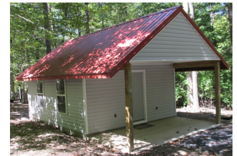
Warrenton Sunrise Cabin