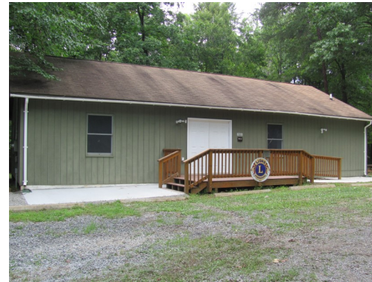
James Durant Hall