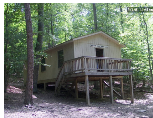
Baileys Cross Roads Cabin