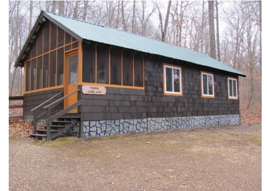
Fairfax Host Cabin

A new formal corporation was formed with its present title and an I.R.S. 501.3c tax exemption was obtained allowing donations to the camp to be fully tax deductible.