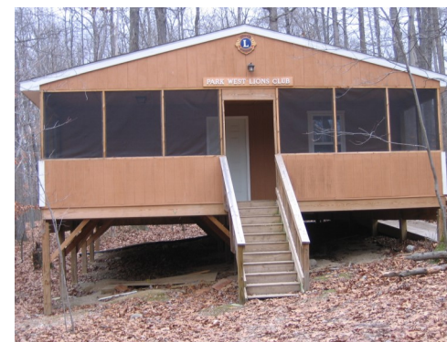
Park West Cabin