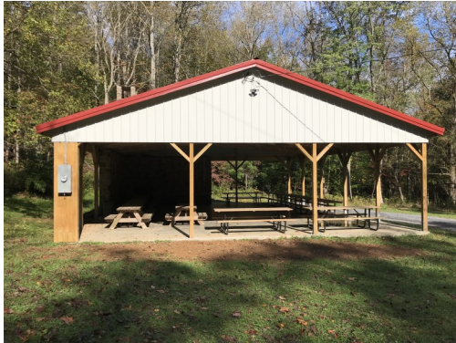
2000 Square Foot Pavilion with Fireplace (Remodeled April 2017)

The Northern Virginia Lions Youth Camp, Inc., is a non-profit public service organization supported by the Lions Clubs of District 24L.